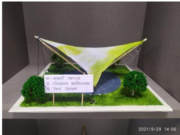
Outcome of the Workshop